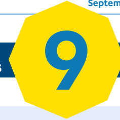
Source: The Times Higher Education World University Rankings, 2021